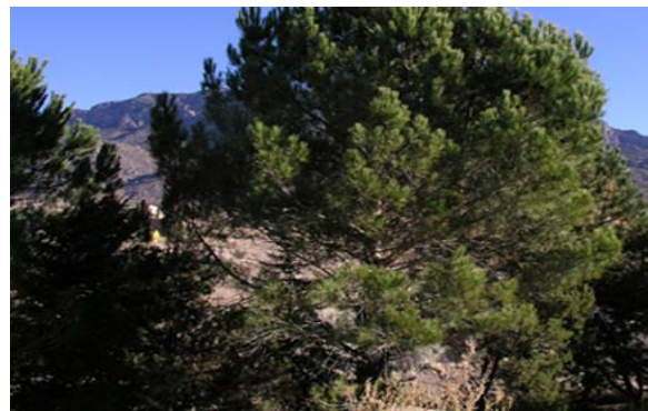
Figure 1: a large pine blocking a view of the Sandia Mountains.

Figure 1 shows a large pine tree that currently blocks a homeowner's view of the Sandia Mountains. The picture is taken from their patio. This tree is more than 22 years old. Figure 2 is a Photoshop image rendered so as to remove the tree to allow one to evaluate the recovered view. This simulates the effect of the tree removal. The result is striking and allows for a full vista view of the mountains.