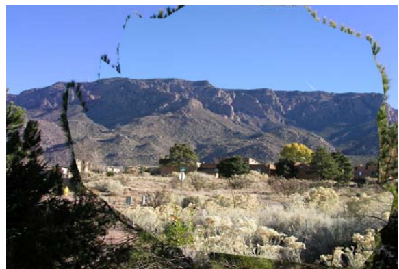
Figure 2: Photoshop rendering depicting the restoration of the spectacular view of the mountains after the large tree is removed. The outline of the tree is purposely left in the scene to orient the viewer.