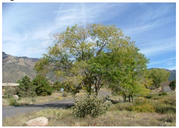
Siberian Elm 10-12 years old

The Siberian Elm invasion in Sandia Heights in many ways is comparable with the Salt Cedar invasion of the Rio Grande Bosque. The salt cedar invasion was allowed to continue far too long. It is now costing enormous amounts of money and effort to rid the Bosque of this weed. If you have Siberian Elm seedlings on your property it would be a lot easier to remove them now rather than deal with them later after they have become very large trees.