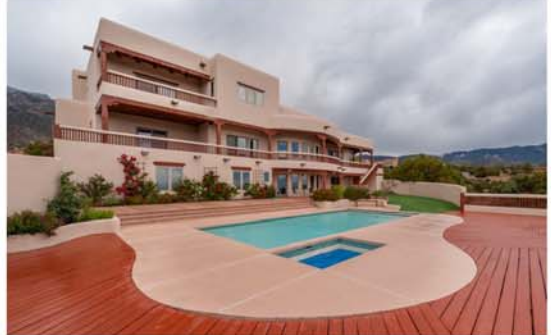
380 BIG HORN RIDGE PL. NE 4-6 BR - 4 BA - 5,516 SQFT

THIS SANDIA HEIGHTS PROPERTY OFFERS STUNNING 360 DEGREE VIEWS OF THE MOUNTAINS & THE CITY VIA THE WRAP AROUND BACK DECK WHICH OFFERS A LARGE INGROUND POOL. SALTILLO TILE FILLS THE MAIN LIVING AREAS AND KITCHEN. RAISED WOOD BEAMED CEILING WITH CLERESTORY WINDOWS MAKE FOR AMPLE NATURAL LIGHT. GRANITE COUNTERS AND TOP OF THE LINE STAINLESS STEEL APPLIANCES IN THE KITCHEN. ALL SECONDARY BEDROOMS OFFER NEW CARPET, AND THE MASTER BATH OFFERS NEW TILE! DOWNSTAIRS OFFERS ALL NEW CARPET, A FULL LIVING ROOM WITH WET BAR AND FRIDGE, 2 BEDROOMS, AND A BATHROOM, WHICH WOULD MAKE FOR THE PERFECT TEEN OR IN-LAW QTRS. SPACIOUS MASTER SUITE ON ITS OWN LEVEL WITH OPTIONAL MEDIA ROOM OR OFFICE, DUAL WALK-IN CLOSETS, AND A JETTED TUB. 4 CAR GARAGE AND PLENTY OF DRIVE WAY ROOM!