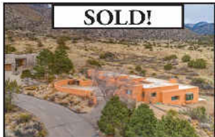
Pinon Hill Place NE