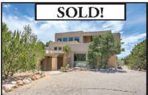
Red Oaks Loop NE

Unique, Custom, SW Style Casa on private view lot. Breathtaking Sandia Mountain Vistas! Sunken greatroom w/ custom Kiva style fireplace & curved Adobe walls, spacious kitchen w/raised T & G ceiling, 3 large bedrooms; Private MBR w/ custom Kiva style fireplace & curved Adobe walls, 2 baths, 2 car garage. Curved driveway, covered patio w/T & G ceiling & privacy wall w/Banco. Offered by Sharon McCollum