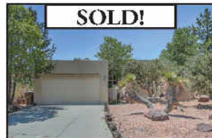
Colony Place NE

Distinctive Sandia Heights! One-of-a Kind, Two Story Custom by Park West on Panoramic View Lot; Upscale thru-out; 5 bedrooms + study + entertainment room + children's play area & 4 baths; upper level; Mbr retreat & bath, view decks. Greatroom with custom fireplace and patio access. Gourmet style kitchen & 3 car, garage; entertainer's patio. Entertainer's Haven! Offered by Sharon McCollum