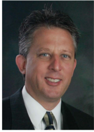
Top RE/MAX Agent Sandia Heights Resident

See What Homes Are Selling For In Sandia Heights www.SandiaHomeValues.com