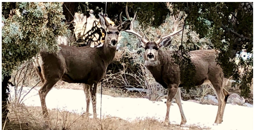
Two of Sandia Heights' neighborhood mule deer.

Later in the article, Rachel Ruden, Iowa's state wildlife veterinarian, cautions that the virus can spread when people feed deer in their backyard , [emphasis added] through sewage discharges or maybe when an animal licks a splotch of chewing tobacco left behind by an infected hunter. Several states are advising deer hunters to take precautions. Eating cooked venison carries little risk, though, as long as the meat reaches an internal temperature of 165°F.