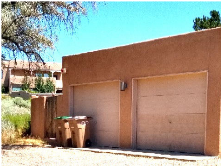
Does your house look like this? If so, you are in violation of Sandia Heights covenants. Please store your garbage cans in your garage or behind an attractive enclosure. Together, let's keep Sandia Heights beautiful !

We would like to remind all residents that trash (including recycling) must be out no later than 7AM on the scheduled pickup day, and no earlier than 5PM on the evening prior to collection. In addition, if you have edible garbage in the bin, please don't put the bin out overnight. We don't want our bear friends to find it. First thing in the morning is better when bears are not hibernating. Thanks for helping keep Sandia Heights a beautiful place for all of us to live.