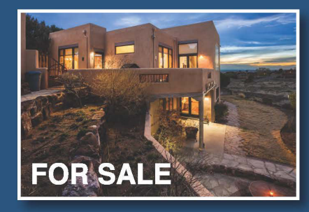
1503 Eagle Ridge Road NE 4/5 Bedrooms • 3.75 Bathrooms • Sandia Heights 5,000 SF • List Price $975,000 • MLS# 965461

Averages Sqft: 2,973 $/Sqft: 206.51 DOM/CDOM: 60/71 O-Price: 619,673 L-Price: 612,214 S-Price: 464,591 *Price statistics for closed listings based on sold price. All other statuses and Totals based on current list price.