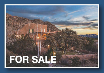
301 Spring Creek Place NE 4 Bedrooms • 2.75 Bathrooms • Sandia Heights 3,882 SF • List Price $1,075,000 • MLS# 965314

FOR A FREE REAL ESTATE REVIEW, CALL OR EMAIL GREG