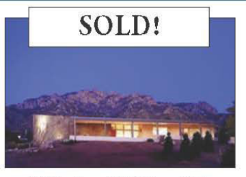
79 Juniper Hill Place NE