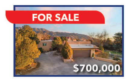
156 Juniper Hill Rd. NE 2924 SQ FT 4BR 3BA .88 Acres

Average SQFT: 3,254 $/Sqft: $260.47 DOM/CDOM: 22/22 O-Price: $856.886 L-Price: $834,470 S-Price: $837,776 LP/SP: 100.63%