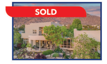
2 Juniper Hill Loop NE 4507 SQ FT 4BR 4BA .60 Acres