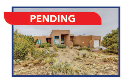
152 Juniper Hill Rd. NE 2294 SQ FT 3BR 2.5BA .56 Acres