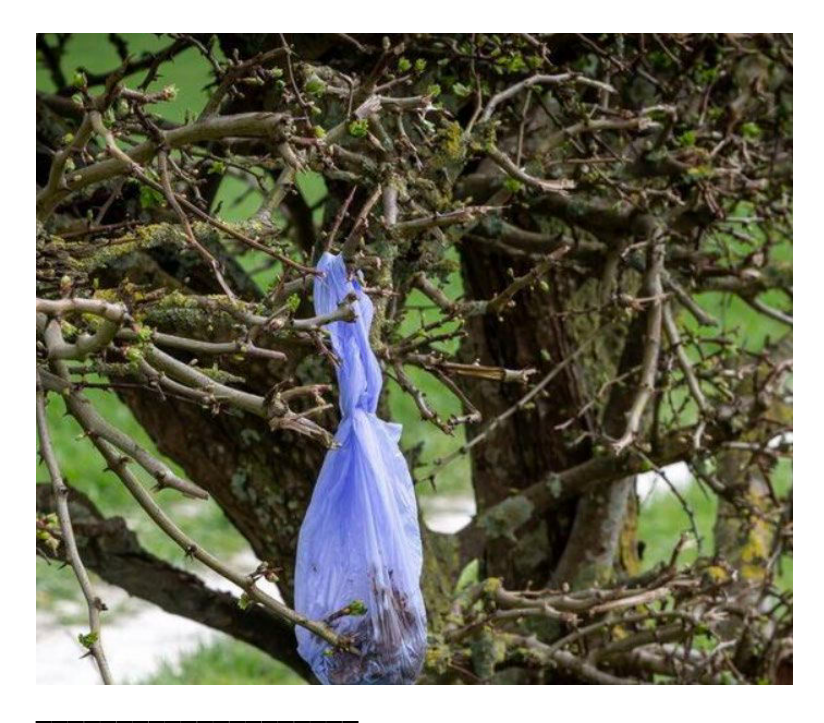
* Jefferson County is a suburban part of Denver in the foothills of the Front Range. Does this kind of locale sound sort of familiar?

One great trick for hikers with dogs is to bring a second, larger bag with a better seal along for the trek. This way, once a poop bag is collected, it can be tucked away without the smells. Toss a dryer sheet in there, too—eventually, you'll probably have to open that bag again. One bag that can work great is a gallon-size Ziploc bag with the slider.