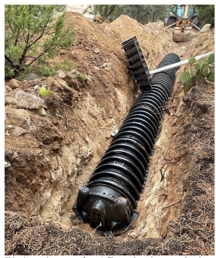
This picture shows one of two Infiltrator brand seepage chambers being installed that will be used to drain effluent exiting the septic tank once the piping is hooked up. This chamber was used because too much rock was encountered at depth, preventing use of seepage pits, and because there was not enough space to accommodate a conventional leach field. I've seen this approach being implemented at other recent septic replacement projects in the neighborhood. The backhoe used in the project can be seen in the background. The black object and white pipe on top of the chamber just happened to have fallen into the trench before this picture was taken, and are not representative of the completed chamber and trench design.

In summary, replacing a failing septic tank may not be a simple "plug and play" if you need an Advanced Treatment System. Beyond logistics, the expense not discussed here—is generally greater for Advanced Systems than for conventional ones. A couple of words of advice if you still have your original system: (1) follow the recommendations in the 1992 GRIT article to extend its life and (2) have a plan of action ready for when your original system begins to fail.