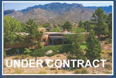
71 Pinon Hill Pl. NE 4 Bedrooms • 5 Bathrooms • 6,070 SF • MLS# 975249

1173 Laurel Lp. NE 4 Bedrooms • 2 Bathrooms • 2,743 SF• MLS# 976120