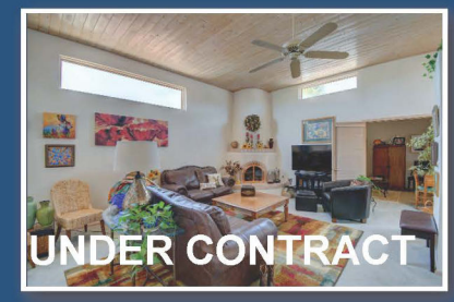
2436 Tramway Terrace Ct. NE 3 Bedrooms • 2 Bathrooms • 1,699 SF • MLS# 971804