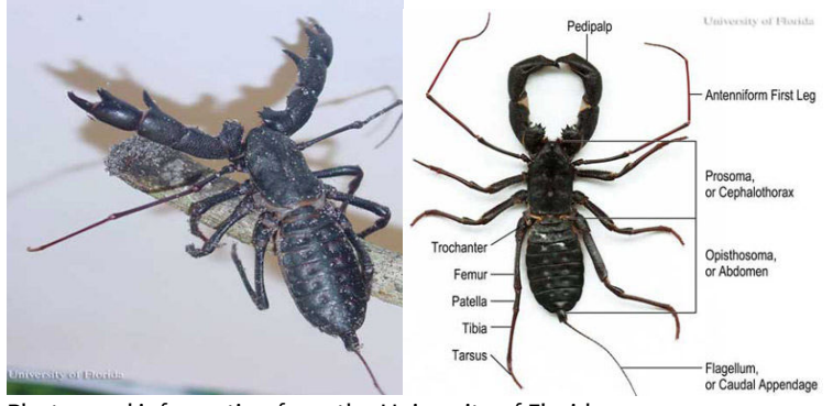
Photos and information from the University of Florida, http://entnemdept.ufl.edu/creatures/misc/misc/giant_whip_scorpion.htm

The vinegaroon, or whip scorpion, or Mastigoproctus giganteus giganteus, looks threatening indeed, due to its size of 2"–3" not counting its whip tail, which can be longer than its body.