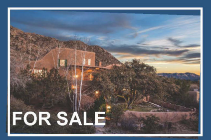
301 Spring Creek Place NE 4 Bedrooms • 2.75 Bathrooms • 3,882 SF • List Price $ 1,000,000 • MLS# 9653 14

When purchasing a home, it's important to think about the overall cost, not just the price of the house. Homes on your wish list may be more affordable today than you think. Please contact me if you have any questions.