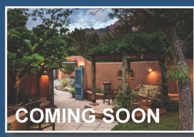
71 Pinon Hill Pl. NE 4 Bedrooms • 5 Bathrooms • 6,070 SF • List Price $1,065,000