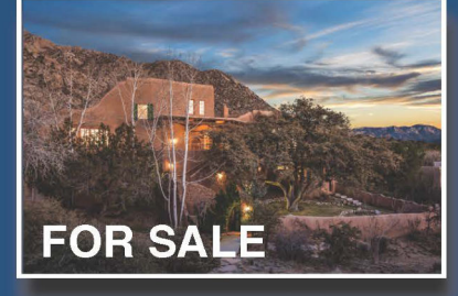
301 Spring Creek Place NE 4 Bedrooms • 2.75 Bathrooms • 3,882 SF • List Price $1,000,000 • MLS# 965314