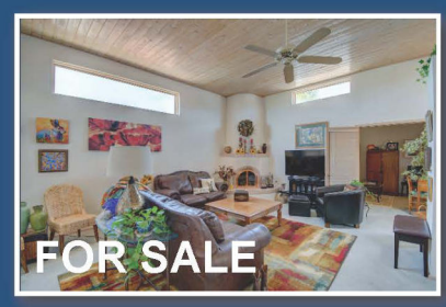
2436 Tramway Terrace Ct. NE 3 Bedrooms • 2 Bathrooms • 1,699 SF • List Price $325000 • MLS# 971804