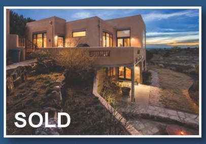
1503 Eagle Ridge Rd. NE 4/5Bedrooms • 5 Bathrooms • 6,070 SF